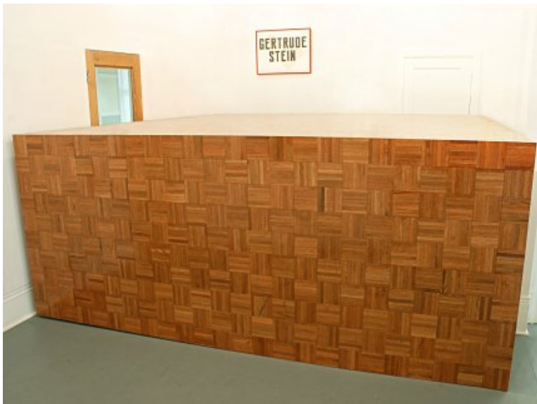
Wade Guyton (USA, b. 1972), The Room Moved the Way Blocked (Stage 1) , 1998.

Meanwhile, an intimidatingly large parquet covered cube blocks the entrance to one office suite. At 16-feet wide, 15-feet deep and 5-feet high, New York City artist Wade Guyton's work forces visitors to either walk around it or climb over it to get to the next room.