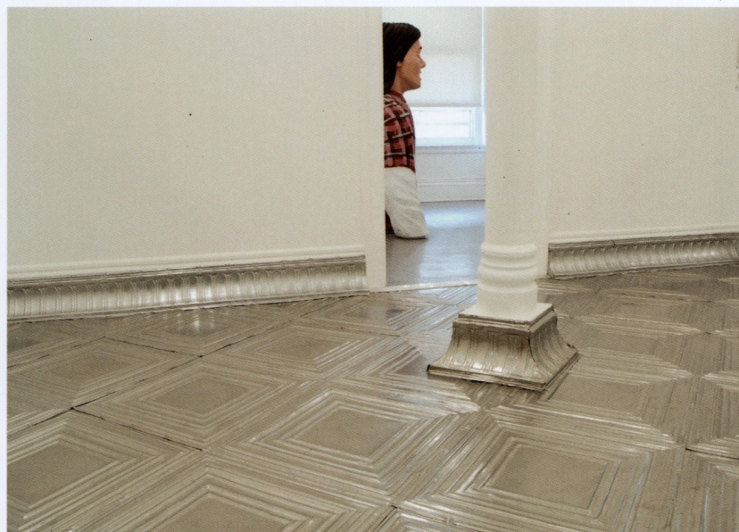
Lawrence Seward 1989, 2001